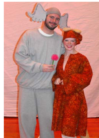
(Seussical the Musical)