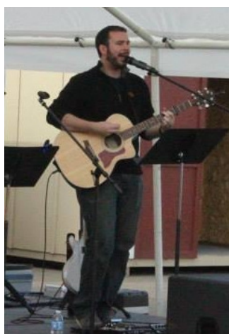
(Flood Relief Celebration)