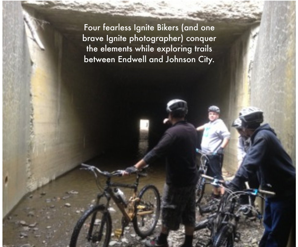
Four fearless Ignite Bikers (and one brave Ignite photographer) conquer the elements while exploring trails between Endwell and Johnson City.