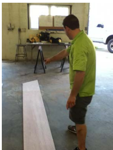
Boat Building Family Ministry

the weekly “Be the Church” (BTC) breakfast meetings for senior high students.