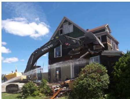
Larry Pierce going to work

For those of you who haven't seen the new view since the Youth House came down, here are a few pictures to fill you in!