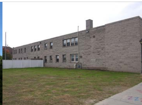
The new view from the street