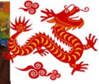
Left, our three-year-olds were treated to the Chinese New Year cuisine and festive attire by some of our families.