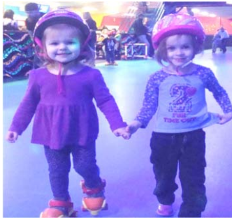
Approximately 250 Skate Estate lovers joined their First Pres. friends for some serious skatin', scootin', & ridin' last month - courtesy of our Parent Council!