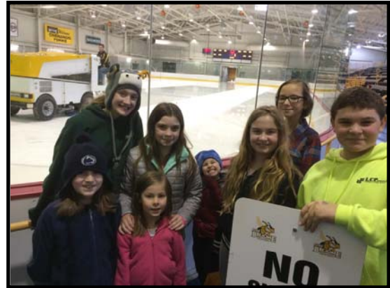
An afternoon of ice skating