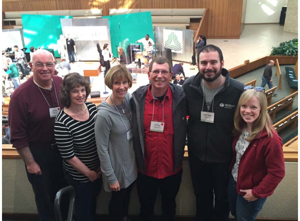
Hello from the ECO National Gathering in Newport Beach, CA!

If you haven't yet checked out the highlight video from the conference, check it out here: https://vimeo.com/155586587