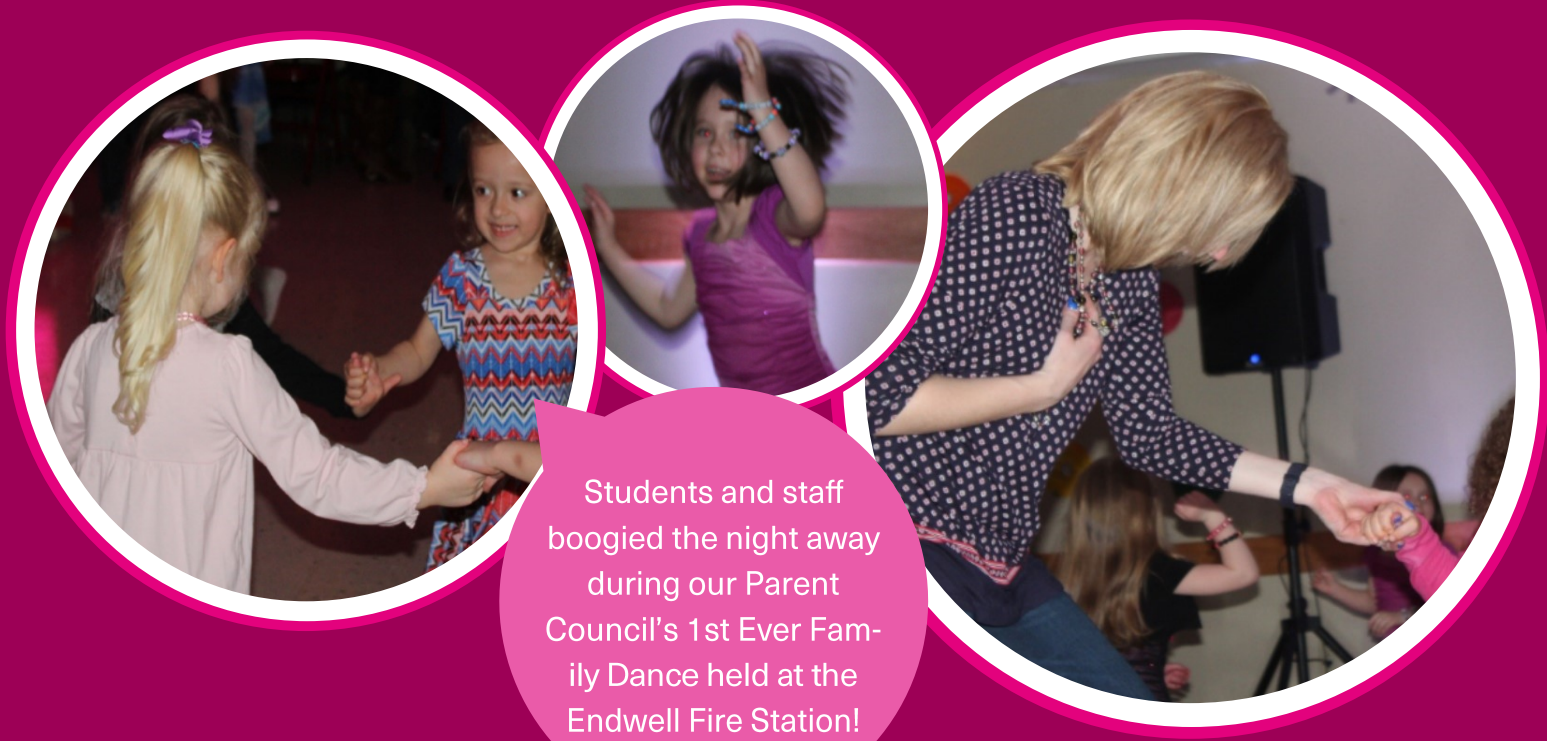
Students and staff boogied the night away during our Parent Council's 1st Ever Family Dance held at the Endwell Fire Station!

If your child will be ready to enter Kindergarten this fall, then join us for