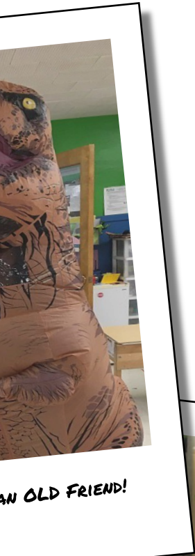
AN OLD FRIEND!