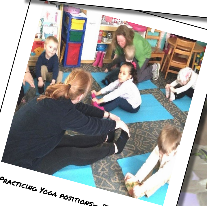
PRACTICING YOGA POSITIONS— "THE SANDWICH"