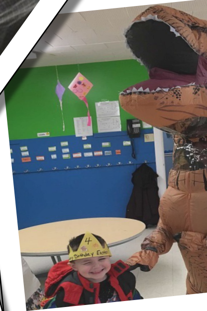
BIRTHDAY SURPRISE FROM A