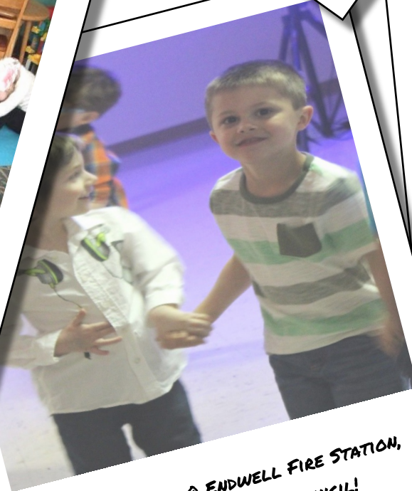
BUNNY HOPPING @ ENDWELL FIRE STATION, COURTESY OF PARENT COUNCIL!