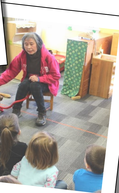
BARK-9 THERAPY DOGS SHARED TIME WITH US